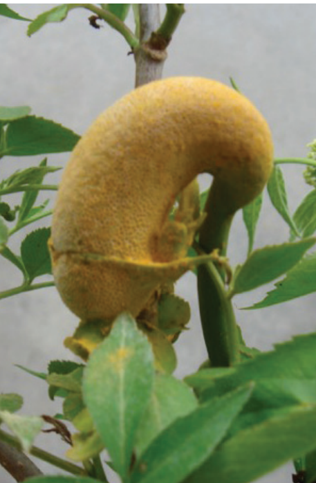
LEFT: Elderberry rust. CENTER: Powdery mildew. RIGHT: Eriophyid mite damage.

Elderberries can be susceptible to blights, rusts, and powdery mildew. Good airflow and pruning of infected canes are typically the best control strategies.